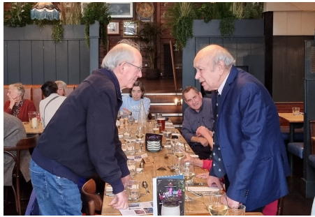
They are still at it!

I wonder what this “knuckles on the table” was about!